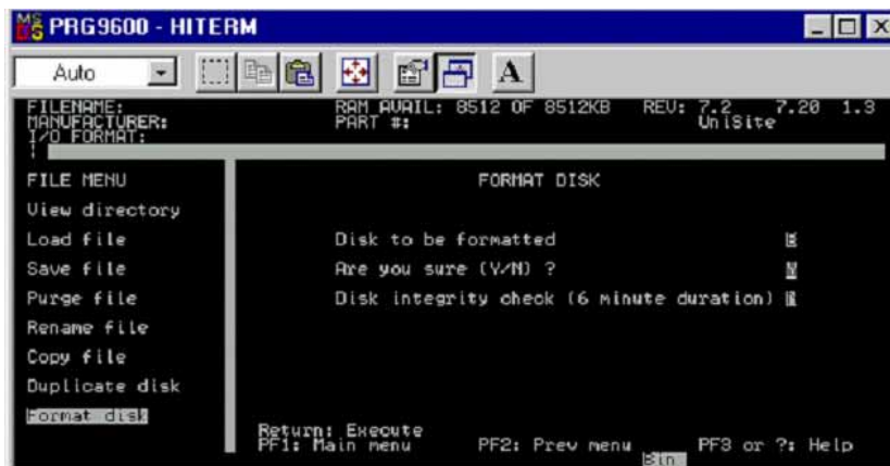
FORMAT DISK screen